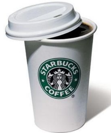
White Chocolate Mocha With Soymilk